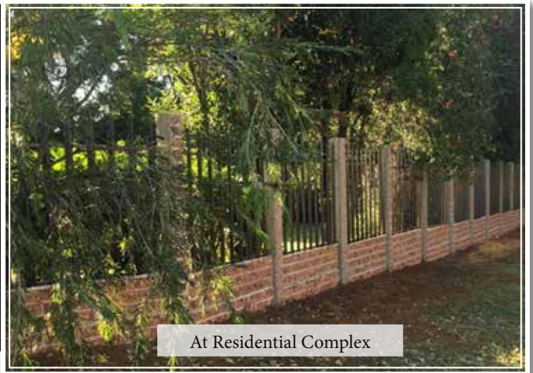
At Residential Complex